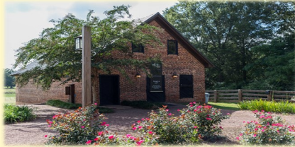
Historic Whiskey Bonding Barn, Molena, GA