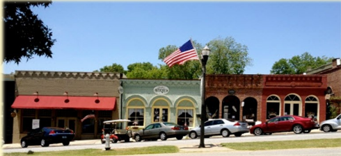
Walking Dead, Downtown Senoia, GA