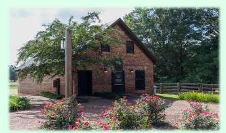
Historic Whiskey Bonding Barn, Molena, GA