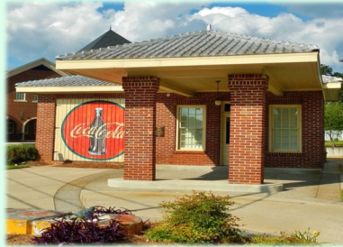
Heard County Historic Gas Station, Franklin, GA