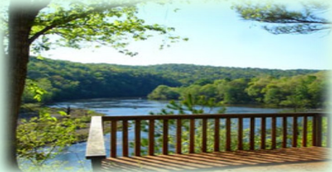
Spirewell Bluff State Park, Thomaston, GA