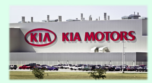
Kia Motors, West Point, GA