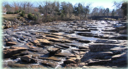
Indian Springs State Park, Flovilla, GA