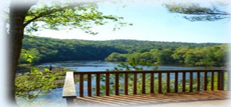
Spewell Bluff State Park, Thomaston, GA