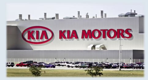
Kia Motors, West Point, GA