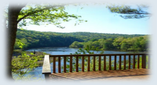
Sprewell Bluff State Park, Thomaston, GA