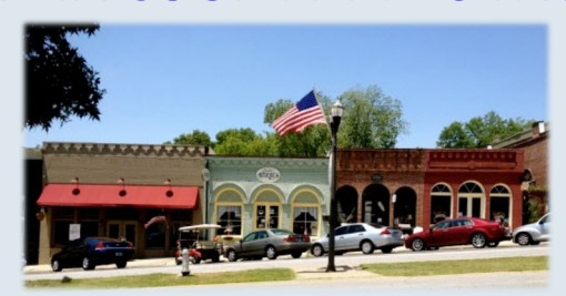
Walking Dead, Downtown Senoia, GA