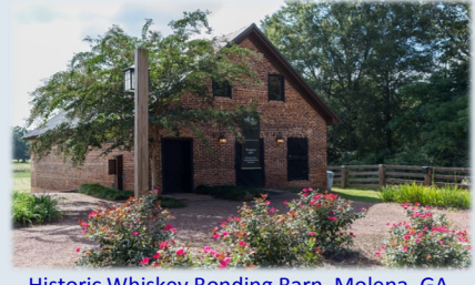
Historic Whiskey Bonding Barn, Molena, GA