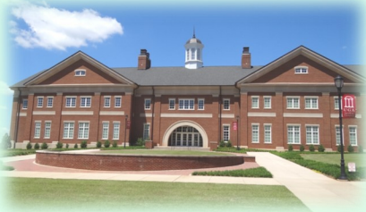
University of Georgia — Griffin Campus Griffin, GA