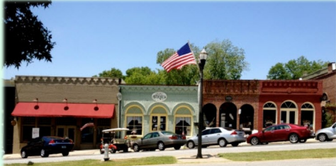
Walking Dead Scene, Downtown Senoia, GA