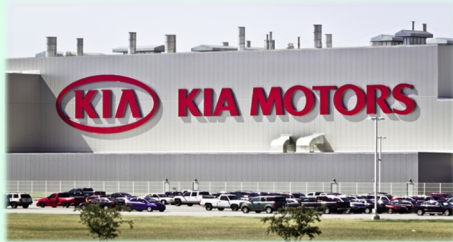
Kia Motors, West Point, GA