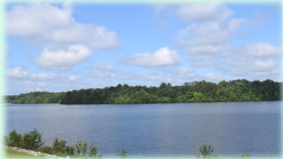
Lake Meriwether, Woodbury, GA