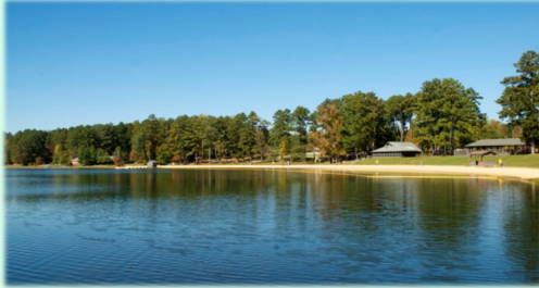
John Tanner State Park, Carrollton, GA